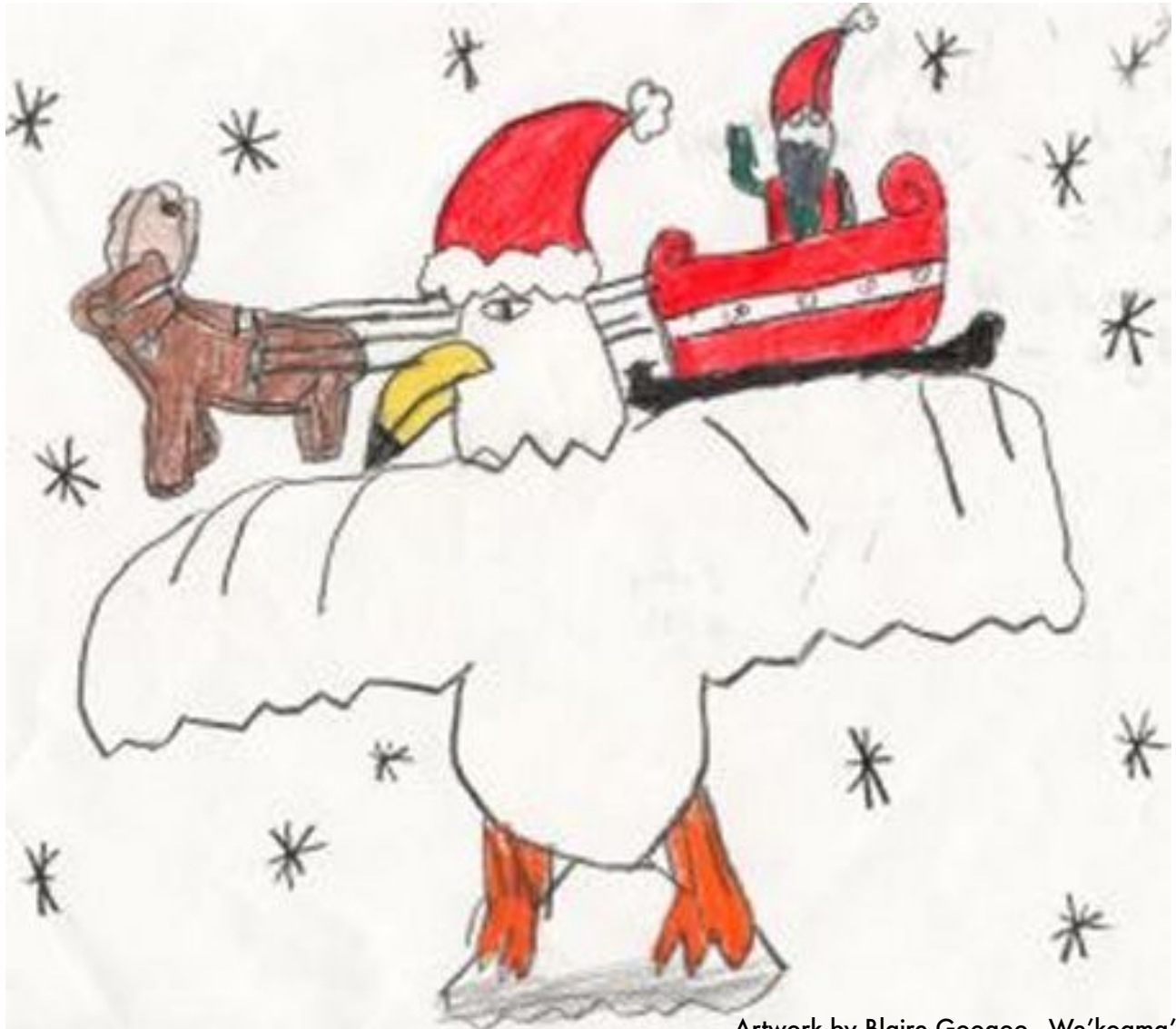
Artwork by Blaire Googoo - We'koqma'q, NS 2000